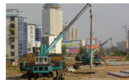
武汉施工 Construction scene in Wuhan