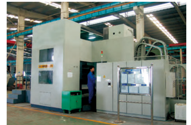
卧式加工中心 Horizontal machining center