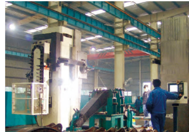
数控双面镗铣中心 CNC double-faced boring/milling center