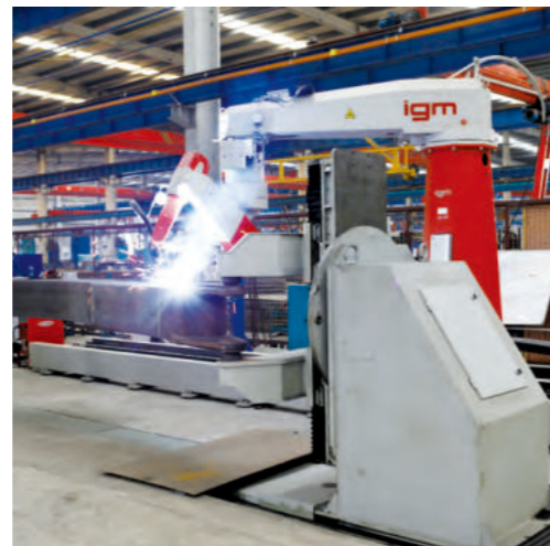
焊接机器人 Welding robot

By centering on the lean thinking and JIT production technology and in combination with the experiences accumulated from the practical production of the company, a production mode with one thinking, one platform, and coexisted multiple production modes is established to meet the demands of different customer groups. With the establishment of network management system for CNC machines, the company owns advanced equipment for guarantee of product quality and an experienced process technic team as the solid backing for lean manufacturing. The process management is standardized and the process disciplines are strictly designed and periodically urged and checked.