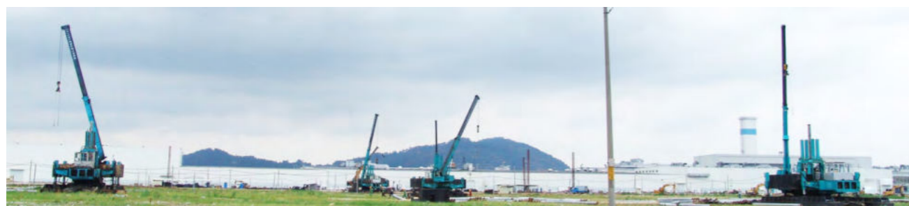
广东南海8台静力压桩机同时施工 Simultaneous construction scene of 8 static pile drivers in Nanhai, Guangdong