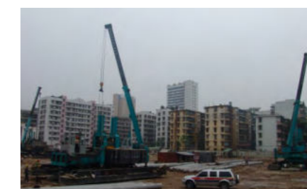
天津施工 Construction scene in Tianjin