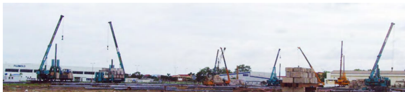
海防5台静力压桩机施工 Construction scene of 5 static pile drivers in Haiphong

山河智能是国内桩机产量遥遥领先的专业制造企业，推进和引领我国静力压桩机技术和管桩行业的发展，公司推出的液压静力压桩机已经批量出口东南亚、俄罗斯、非洲、美洲等地，在全球市场占有率达到65%。