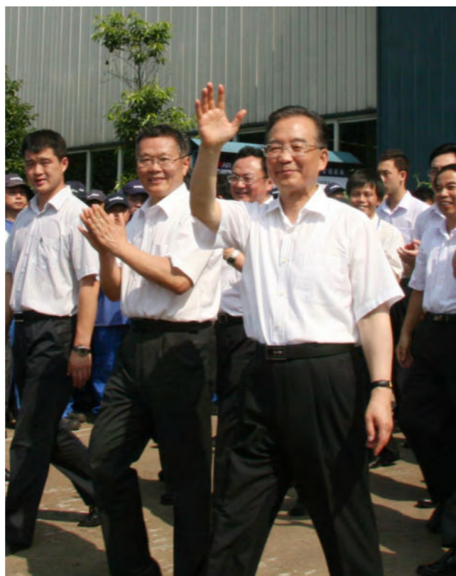
2010年7月2日，时任国务院总理温家宝视察山河智能 肯定自主创新 Jul. 2nd, 2010, the ex-premier Wen Jiabao visited SUNWARD Highly praised independent innovation