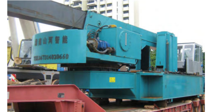
模块化设计，运输方便 Crane moment limiter (Optional)