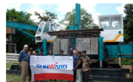
孟加拉施工 Construction scene in Bangladesh