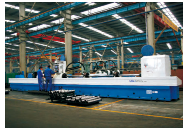
数控深孔镗床 CNC deep hole boring machine