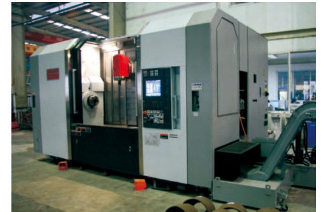
五轴联动车铣加工中心 Five-axis interpolation lathing/milling center