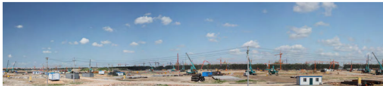
大庆油田多台静力压桩机施工现场 Construction scene of multiple static pile drivers in Daqing Oilfield