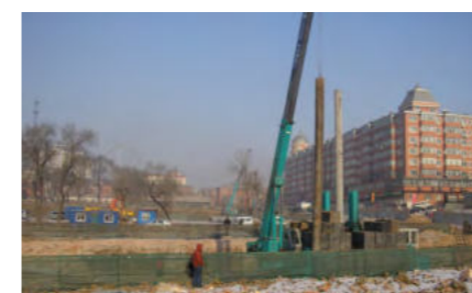
俄罗斯施工 Construction scene in Russia

As the professional manufacturer with far leading production capacity in domestic pile driver industry, Sunward is boosting and leading the development of China's static pile driver technologies and tubular pile industry. Our static hydraulic pile drivers have been exported in batches to Southeast Asia, Russia, Africa, and America, with the global market share hitting 65%.