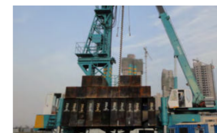
河南施工 Construction scene in Henan