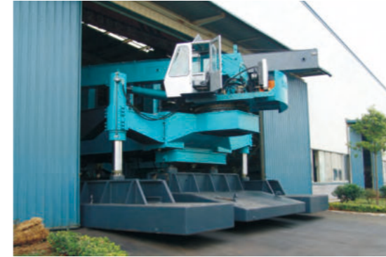
新型液压步履式行走 New hydraulic walking chassis

The new hydraulic walking chassis is built by the technologies with automatic reset and slewing compensation functions.