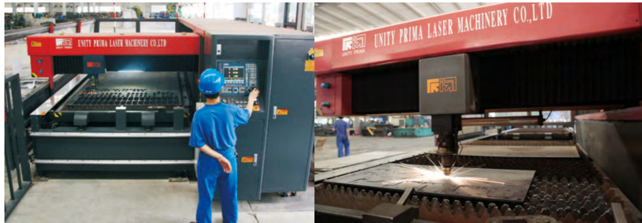
高精度数控激光切割 High-precision CNC laser cutting

以精益思想和JIT生产技术为核心，结合公司实际生产积累的经验，建立一种思想、一个平台、多种生产模式并存，满足不同客户群体需要的生产模式。公司拥有确保产品质量的先进设备，建立了CNC数控机床网络管理系统，拥有一支经验丰富的工艺技术团队作为精益化生产的坚强后盾。规范工艺管理，严肃工艺纪律并对工艺纪律作定期督促与检查。