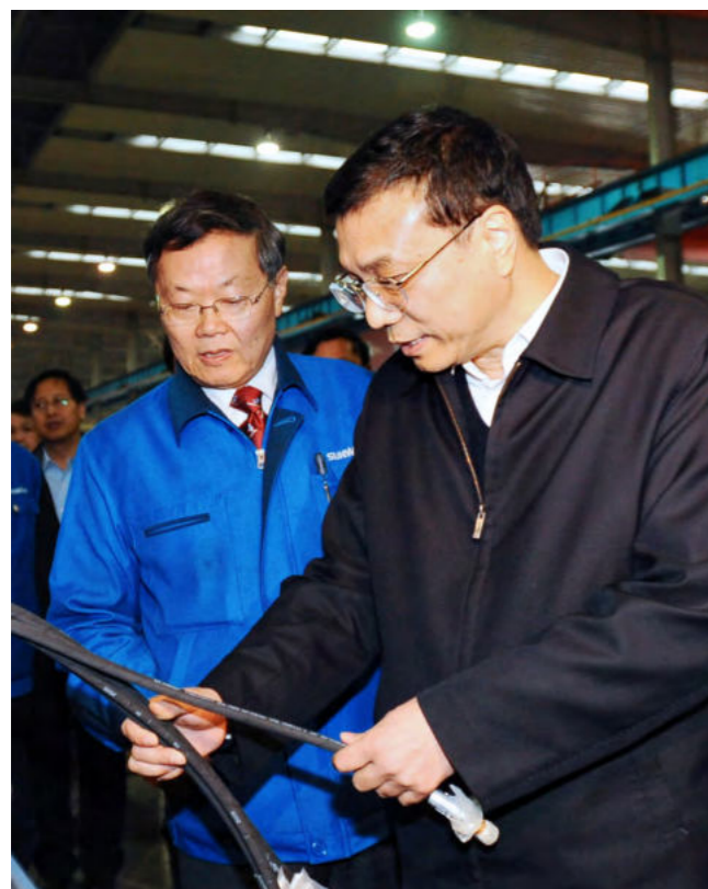
2009年3月29日，现任国务院总理李克强视察山河智能 Mar. 29th, 2009, the present premier Li Keqiang visited SUNWARD