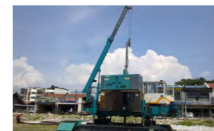
马来西亚施工 Construction scene in Malaysia